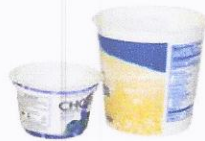
Yogurt and butter containers