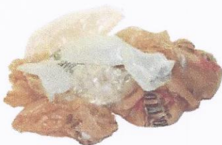
Plastic grocery bags (combine bags into one)