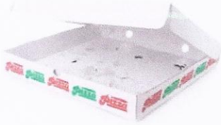
Pizza boxes (empty) (no food residue)