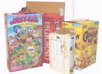
Boxboard (cereal boxes)