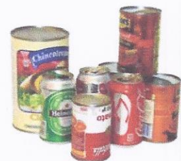
Aluminum and steel / tin cans