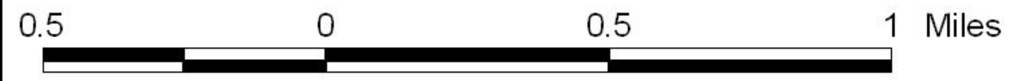
Appendix F - Potential Components